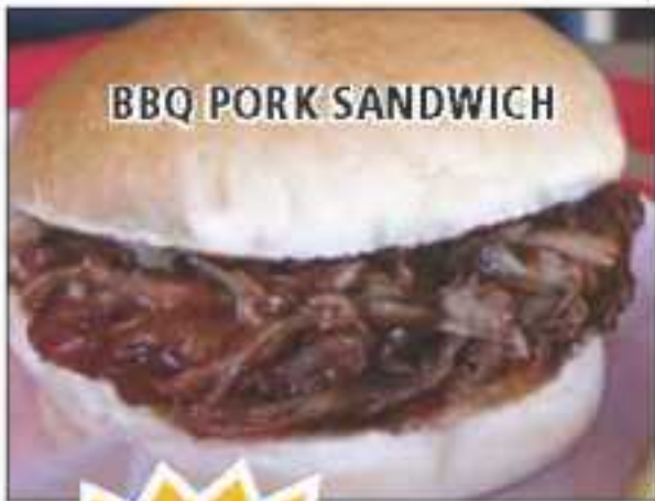
BBQ PORK SANDWICH